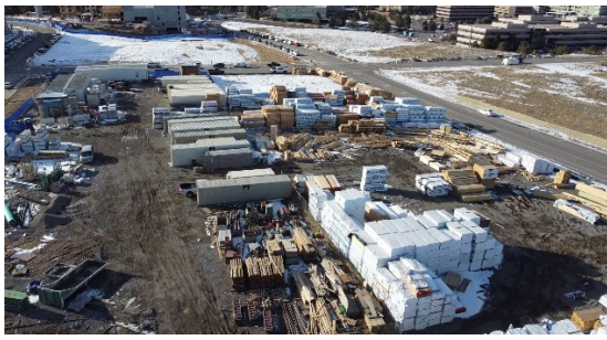
Parcel 11 (View: Northwest)