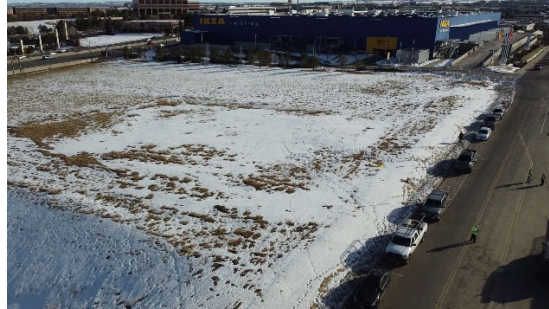
Parcel 3 (View: Southeast)