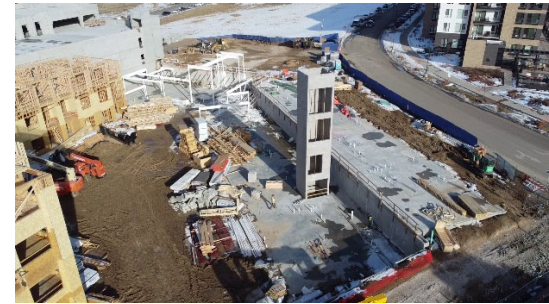
Parcel 8 (View: Southeast)