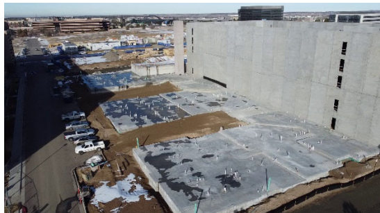
Parcel 6B (View: North)