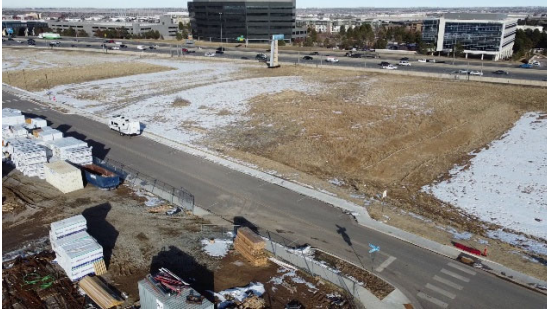
Parcel 2 (View: Northeast)