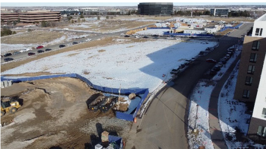
Parcel 9 (View: Northeast)