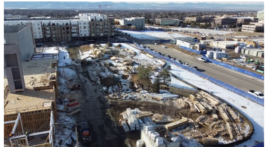
Parcel 6A & 7A (View: Southwest)